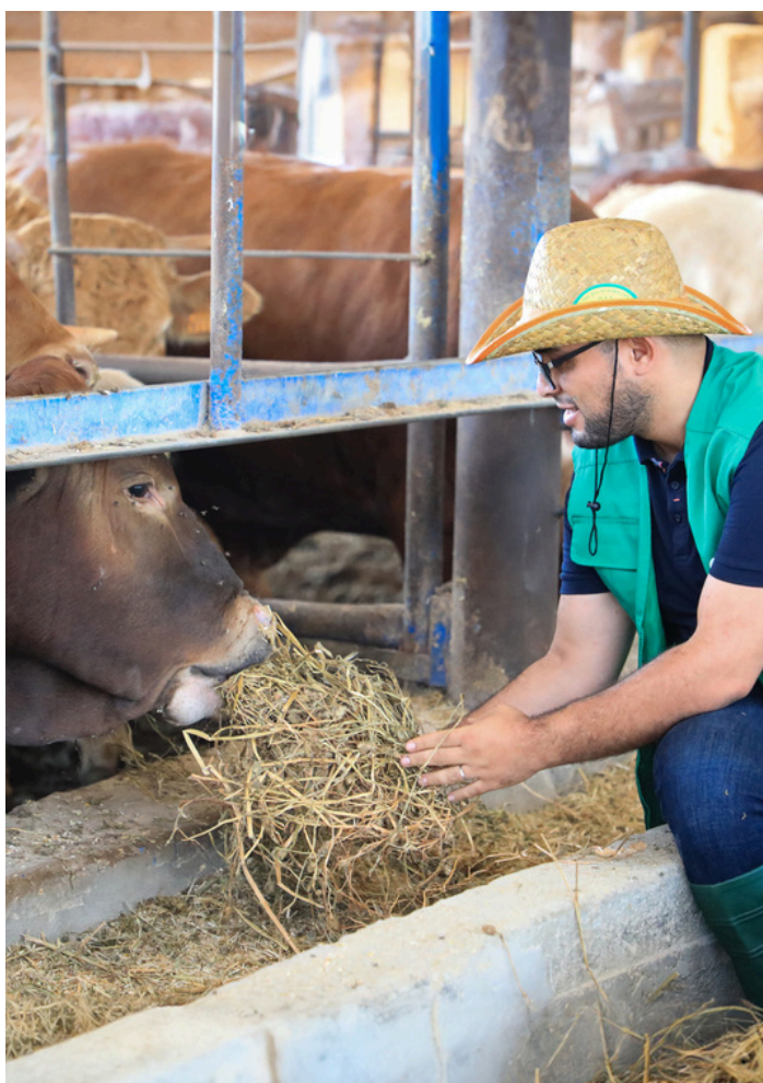
Your Qurbani Donations in Action

With your donation, we ensured that the most vulnerable families received fresh meat within the three days of Eid. We also worked with experienced butchers and faith leaders in each community to ensure the entire process is ethical and in accordance to Islamic tradition.